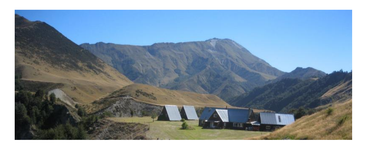
Ben Lomond Lodge & Chalets, Ben Lomond Station

If you are keen for a little more adventure over the race weekend – look no further! How does a 4WD adventure to a remote Mountain Lodge before enjoying a hearty dinner and pre-race banter with likeminded others and an awesome Heli Ride over the course to the start line the following morning sound to you?!